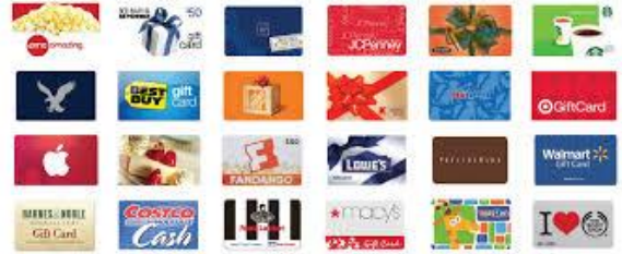
representation of the types of cards you can get

For example, you might buy a grocery store card for $100, if the card has a 5% to you your students account will get $5 added to your student's account. That daily Starbucks can earn credit to your student's account. A win-win scenario.